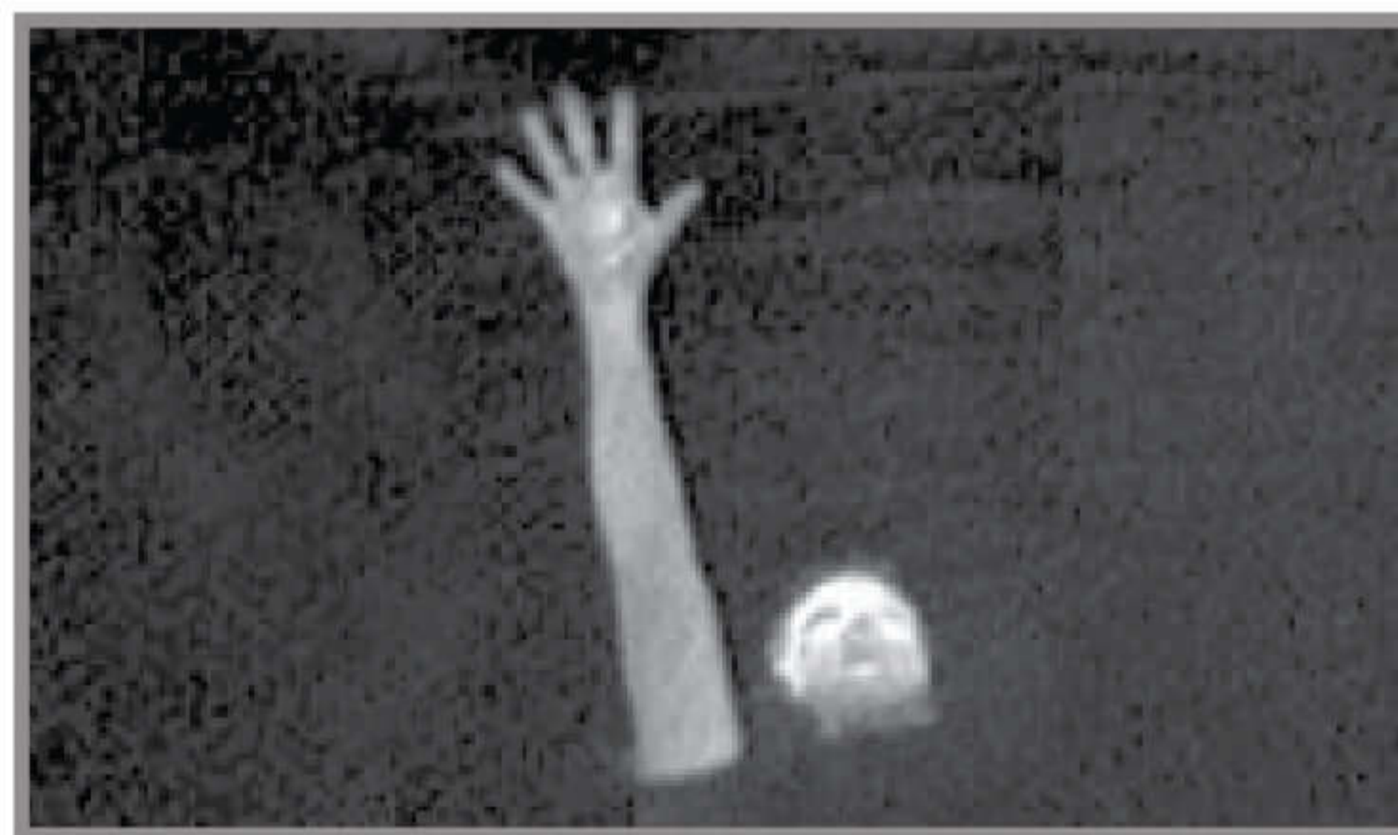
MS- / MLS-Series